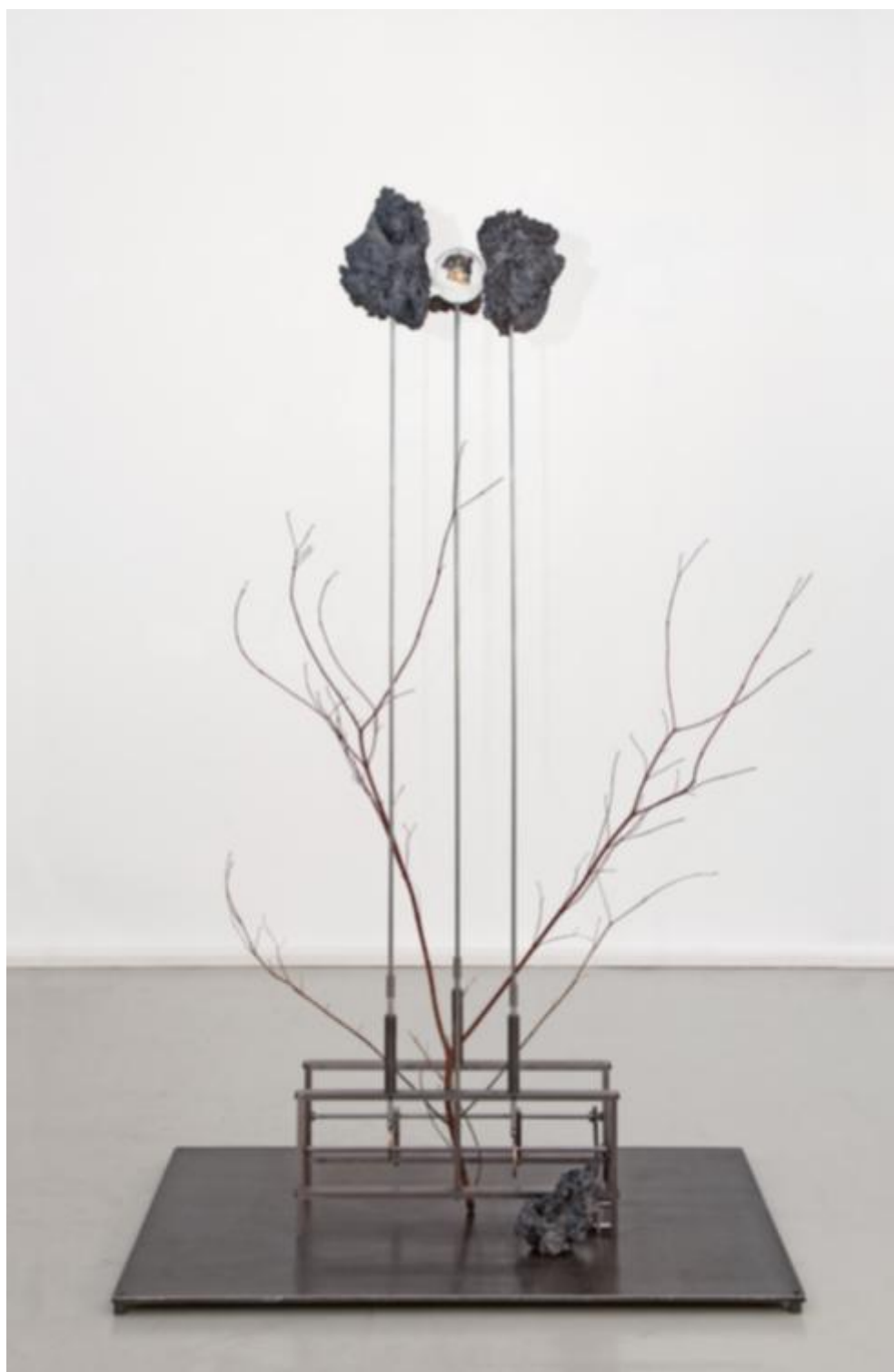
Rebecca Horn, Der Feuerfall, 2013. Volcano stones, steel, brass, glass, gold leaf, branch, motor, electronic device, 76 3/4 x 47 1/4 x 31 1/2 inches.

HORN: Right, only my son and Goya. [laughs]