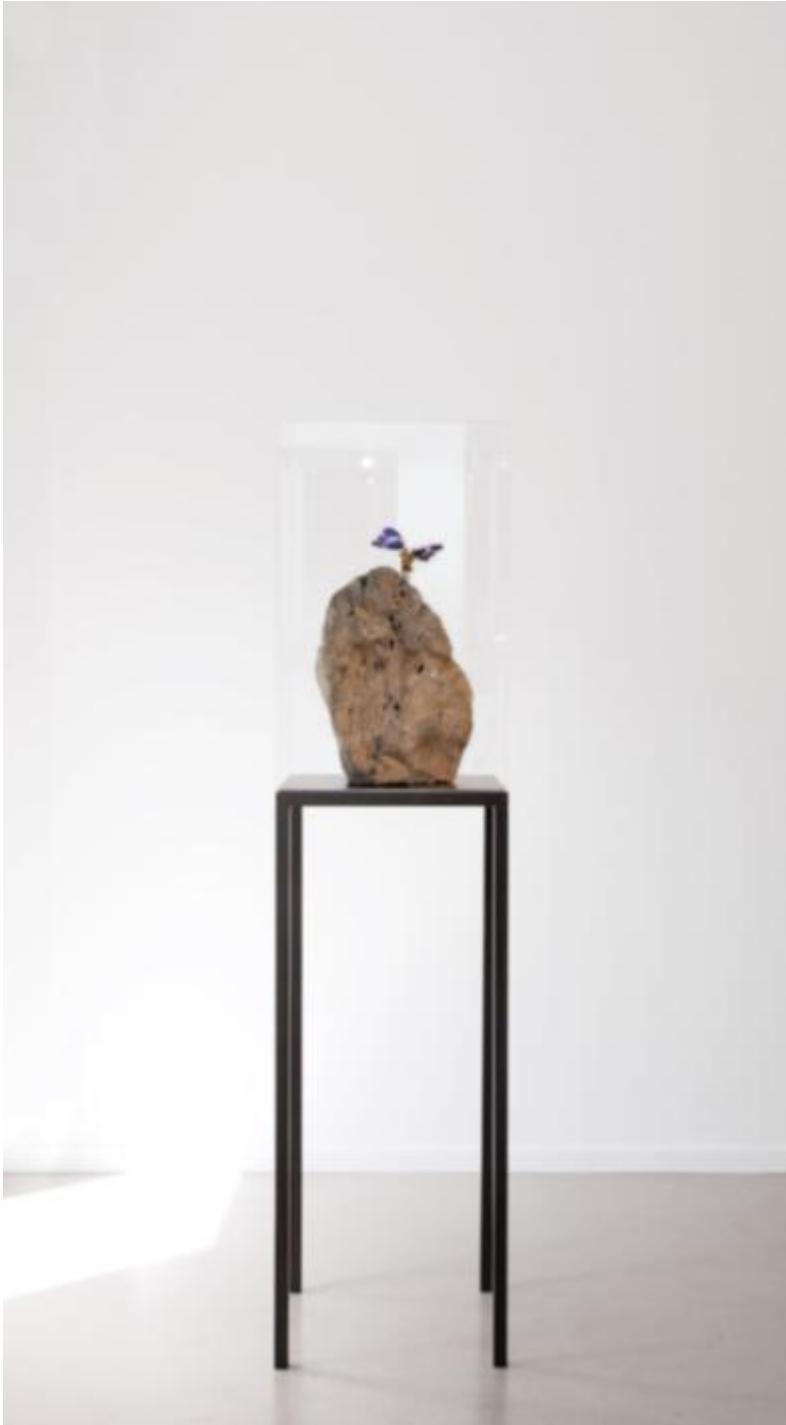
Rebecca Horn, Metamorphoses between Rock and Butterfly , 2014. Stone, art butterfly, steel, wood, electronic device, motor, transparent cover, 63 3/8 x 16 1/8 x 16 1/8 inches. © Rebecca Horn. Courtesy: Sean Kelly, New York.

KURT MCVEY: You wrote a poem to coincide with this opening, also titled The Vertebrae Oracle (Das Wirbelsäulen Orakel), for your friend Méret Oppenheim. It opens with the line, "In the fear-love." How do those two words, for you, correlate with one another? In other words, can you have fear without love or love without fear?