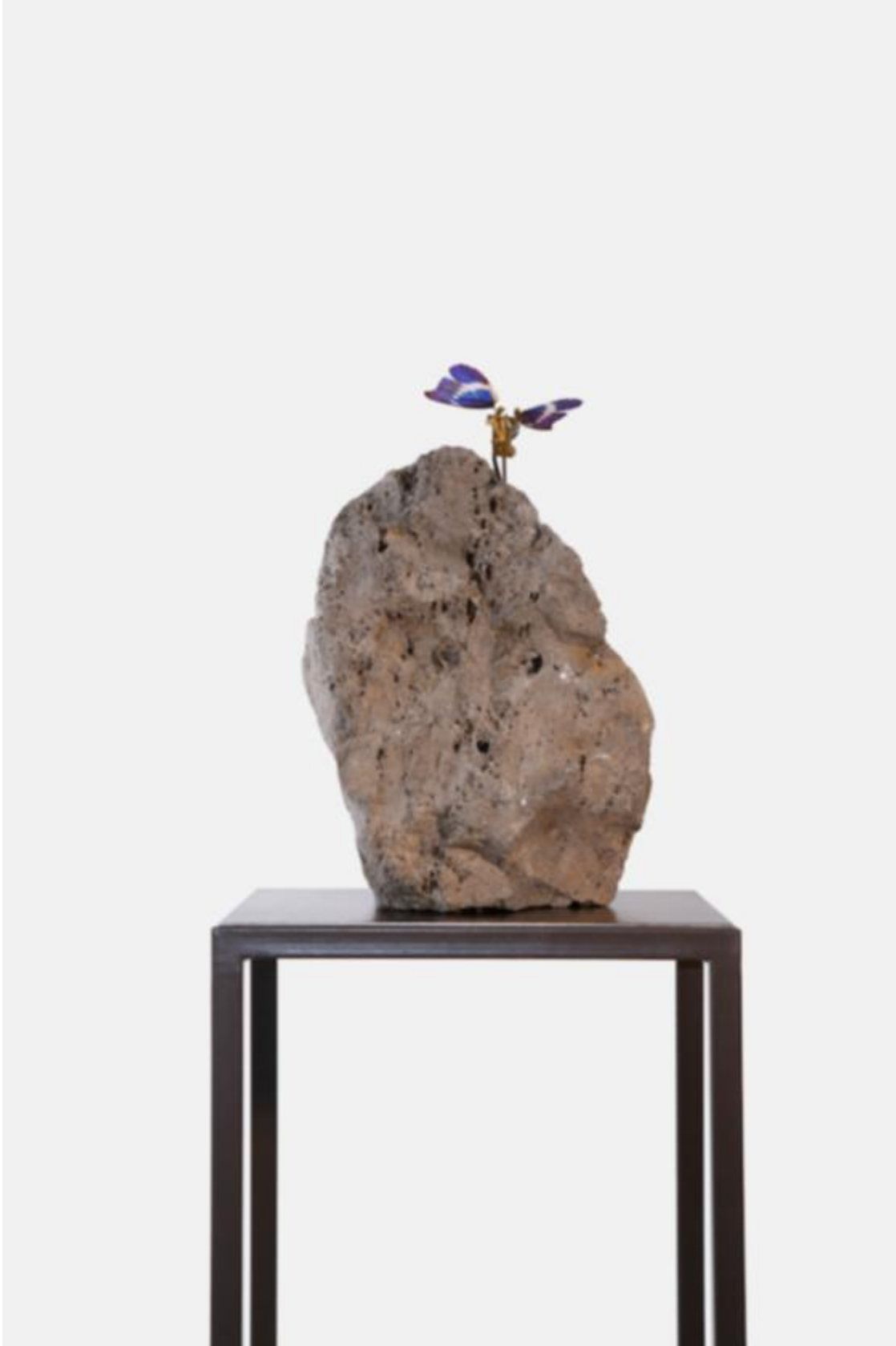
Rebecca Horn, detail of Metamorphoses between Rock and Butterfly , 2014. Stone, art butterfly, steel, wood, electronic device, motor, transparent cover, 63 3/8 x 16 1/8 x 16 1/8 inches. © Rebecca Horn. Courtesy: Sean Kelly, New York.