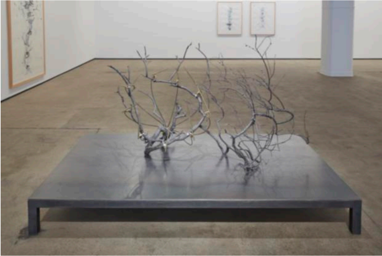
Rebecca Horn, installation view of The Vertebrae Oracle at Sean Kelly, New York, May 10 - June 21, 2014.

Rebecca Horn's first New York solo exhibition at Sean Kelly Gallery since 2011's "Raven's Gold Rush," "The Vertebrae Oracle" features a collection of six new sculptures and eight large-scale paintings on paper. These works attempt to break down the earthly and somewhat restrictive constructs of our daily lives in order to make way for a more enlightening exploration of nature and all its ethereal wonders. Though Méret's presence looms large, Horn's exciting new collection is entirely her own. Upon entering Sean Kelly's "front gallery," the first piece sure to catch a wondrous gaze is Marcel Duchamp's Montgolfière , (2014), a wall-mounted sculpture that features an original disk (humbly named Cinéma Vérité by Horn—also a longtime collector) that once belonged to Duchamp himself. Three featured, unsynchronized components reflect diverse, non-repeating specters of fractal light across the large gallery walls, while guests simultaneously take in an eclipsed image of themselves in two accompanying rotating mirrors. Montgolfière , the French word for "hot air balloon," seems to allude to Duchamp's aversion to "retinal" art, illuminating Horn's shared predilection for spiritual transcendence through more conceptual works.