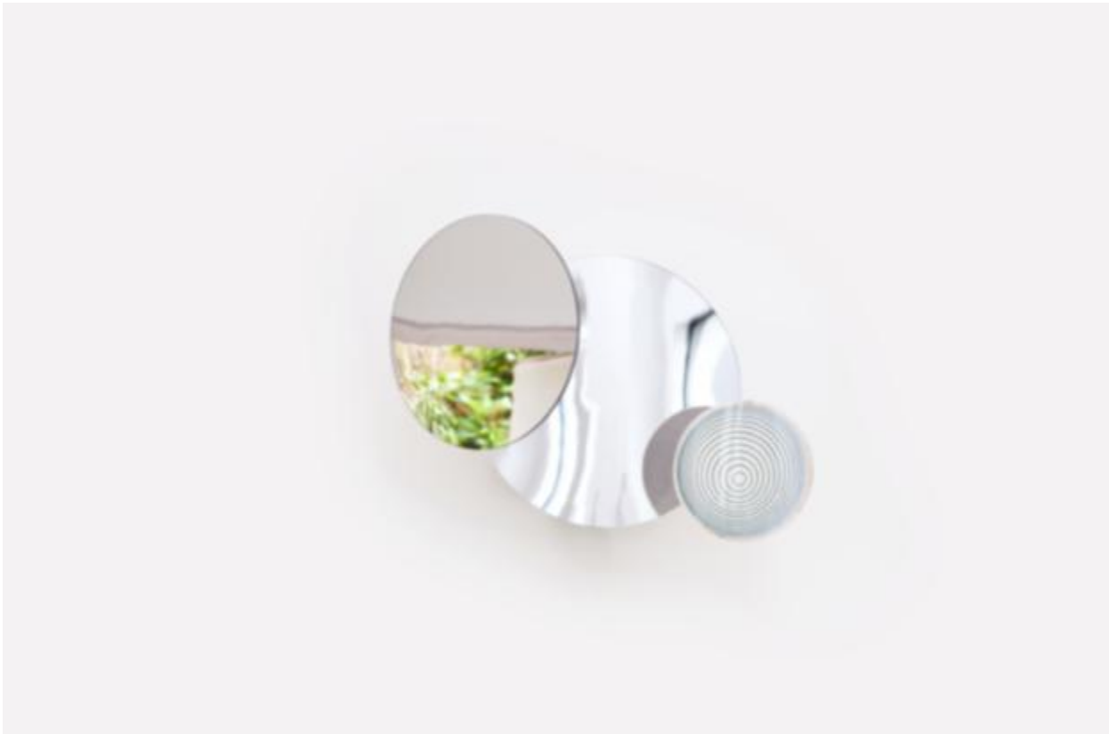
Rebecca Horn, Duchamp's Montgolfiere, 2014. Mirror, glass, motor, electronic device, 21 5/8 x 23 5/8 x 24 13/16 inches. © Rebecca Horn.

HORN: Yes, but only in the photograph. They are two ancient volcanic stones, and they're moving dangerously close to a crystal ball; less than a millimeter away. Behind it is a smaller volcanic stone with gold, which, due to an optical illusion, appears to be descending back into the earth. This is a commentary on the global financial crisis. In Germany, we were looking at Lehman Brothers and the state of the dollar and we were very nervous. The name, Feuerfall , implies the volatile and ultimately destructive nature of a volcano, where things jump up, but inevitably fall back down.