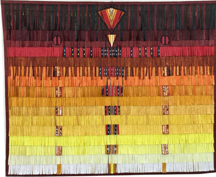
Abdoulaye Konaté, Composition en jaune, 2018.