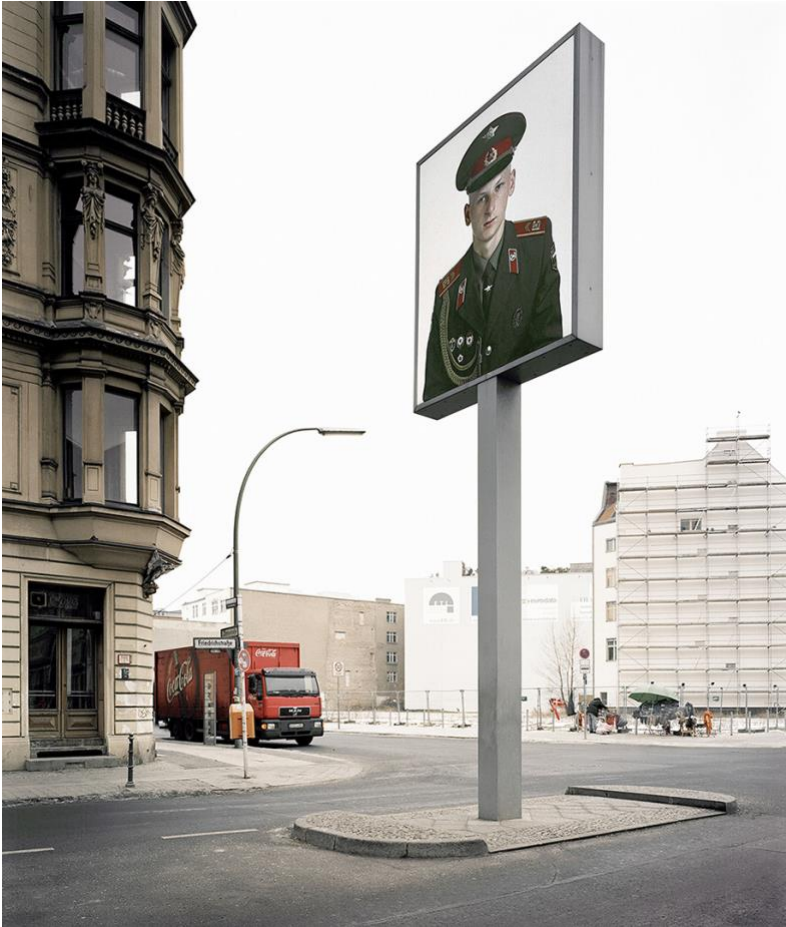
Frank Thiel, Installation image at former Checkpoint Charlie , 1998.

Placing an artwork permanently in the public and placing an artwork in an art space for a limited period of time are very different constellations and therefore do require very different considerations to achieve the potentially desired communication you're mentioning.