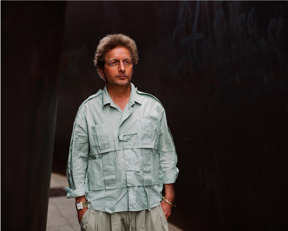
Frank Thiel © Antony Sojka

Furthermore I was never interested in developing a specific visual language, style or concept that would provide me with a certain framework within which I find my visual solutions. That seemed to me like a self-imposed restriction, like a creative standstill. Some artists might be satisfied with photographing the whole world in a similar way all their life. But I believe that one can and should approach different subjects differently, with an open-minded view, with a curiosity to break new visual ground and with the ability to constantly question your own work and achievements. I am interested in artistic development and I don't want to feel that my work is jumping on the same spot like a needle on a broken vinyl, even when the music on this vinyl may have found many lovers and received wide acclaim. That's why I prefer my tree to bear many different kinds of fruits instead of one fruit only.